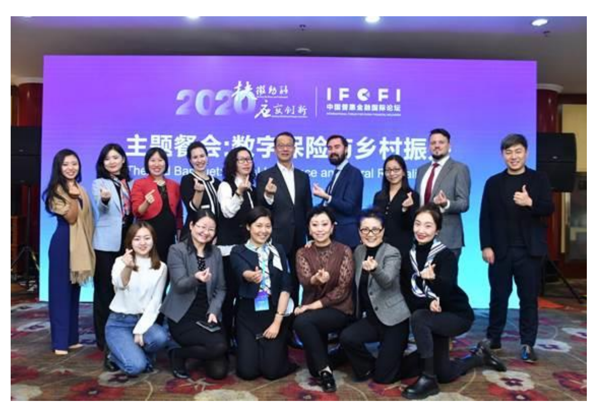
The Digital Insurance and Rural Revitalization Forum ("Forum") is a virtual community initiated