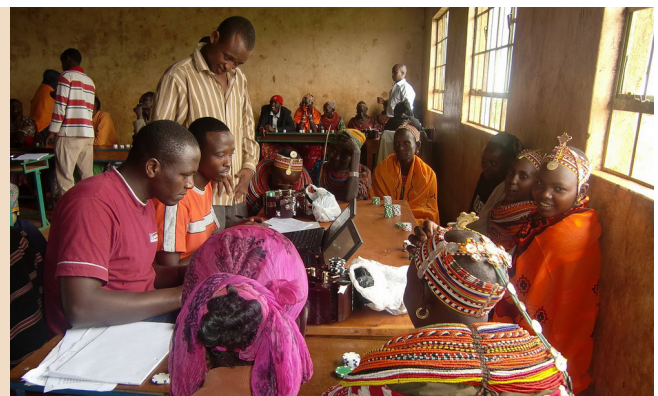
ILRI representatives play a game to illustrate insurance products to Maasai herders in Kenya

Syngenta, has just launched its Kilimo Salama crop insurance in Rwanda and has installed eight weather stations in the country. (Kenya, Rwanda)