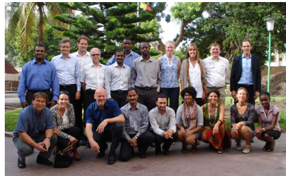
GIIF Implementing Partners at second annual GIIF Workshop, Senegal September 2012

Most importantly, farmers are learning that index insurance can be trusted. The implementing partners have made immediate payouts to several thousand farmers in Kenya and Rwanda after excessive drought or rain as measured by weather indexes. These payouts provide important seed capital for the economic recovery of